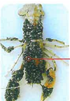
Ontario Ministry of Natural Resources